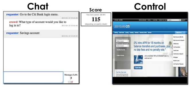
Figure 2: Layout of Legion: Mobile's two-role worker interface.

Legion:Mobile's worker interface (Figure 2) must be designed to allow workers to switch easily between their two roles. In their first role, workers are asked to hold a conversation with the user to determine what task needs to be completed (this is simple if the user clearly specifies the task and no clarification is needed). In their second role, workers are asked to collectively complete the task on the user's mobile device. This is enabled by providing a remote desktop connection to the user's device on the right side of the screen. Users can interact with this interface as if it were any other application, and their input is forwarded back to the user's device.